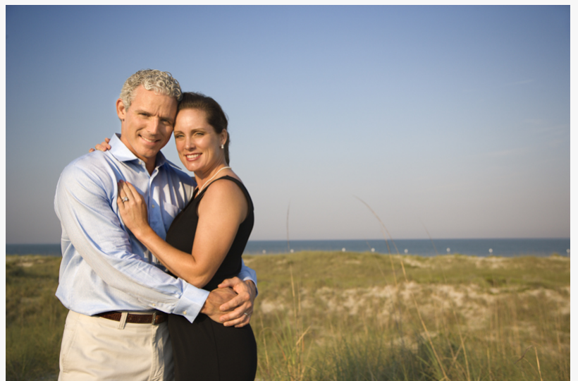
Clairvoyants Hope To Make Love Happen For Someone