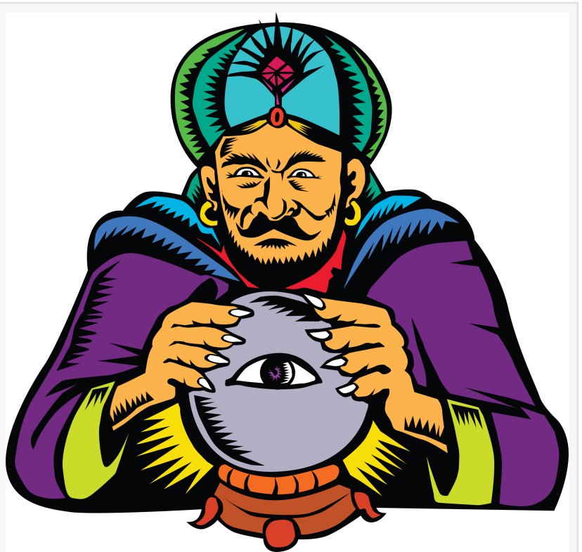
A psychic can help you to solve a problem.

Most people that are not psychic often feel that they do not understand how the clairvoyant gift works. Many articles on thehelpfulpsychic.com will educate a person on how a psychic got their