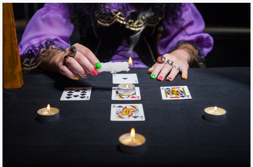
Wait For Your Psychic Reading To Come True