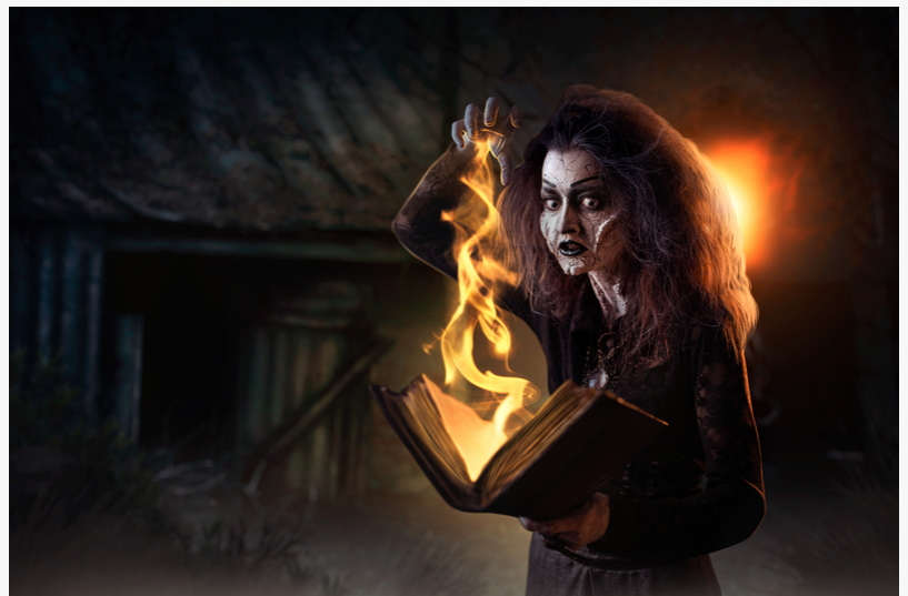
Psychics Want To Help People Everyday