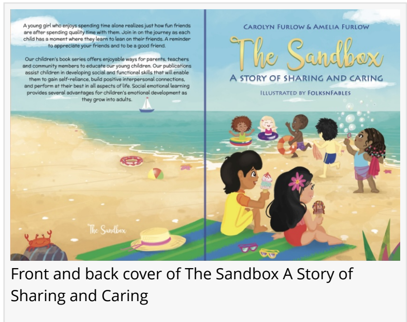
Front and back cover of The Sandbox A Story of Sharing and Caring