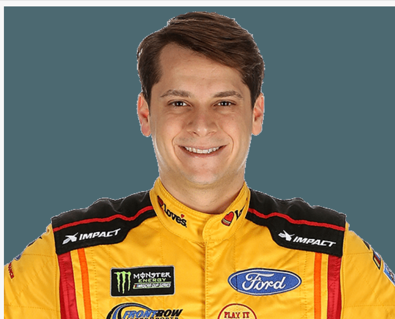
Landon Cassill, NASCAR Driver