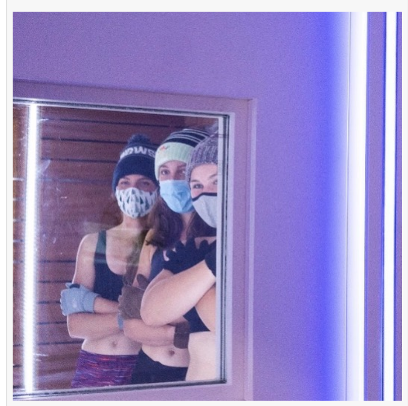
Light Blue Clinic's cryochamber can reach as low as -160°C