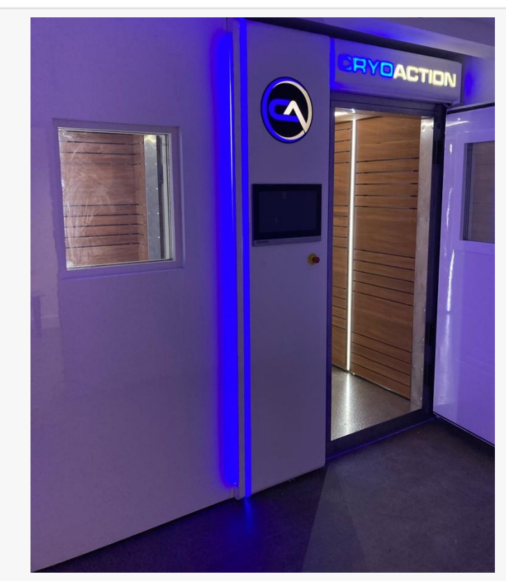
CryoAction's CryoDuo WholeBody Cryotherapy Chamber installed in Light Blue Clinic

The extreme-cold treatment has, in the past, only been available to world-class sporting stars so we're delighted that the Light Blue Clinic has made cryotherapy an accessible option for people in and around Cambridge.