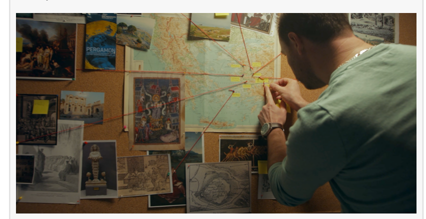
Mapping the 7 churches in Revelation, now in modern day Turkey.

the first three churches that Saint John addresses: Ephesus, Smyrna, and Pergamon, as well as the Island of Patmos where the book was penned. The following two films in the series will be released in 2022 and 2023 respectively.