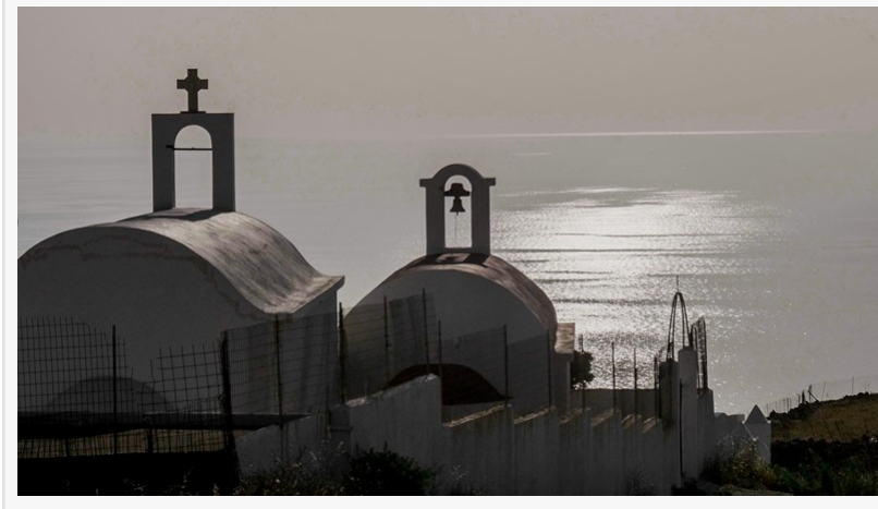
Chapels on the Island of Patmos