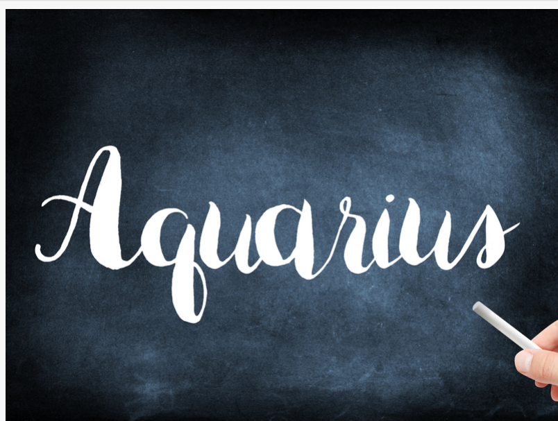
A Prediction Can Be Factual

A horoscope may tell someone that they are about to meet their soulmate. Twin Flame Writer says that whenever she writes a horoscope, it is important to tell the reader that not every prediction is 100%. A lot has to do with the time that a person is born.