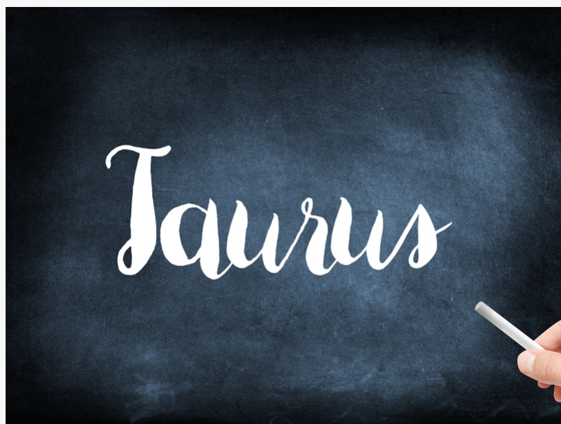
Horoscopes Have Meaning

Astrology has a lot of pseudoscience that is put into it says the writer. A general horoscope is not always accurate. If someone wants an accurate horoscope, they should instead have one constructed by a professional astrologer.