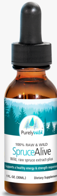
Raw SpruceAlive - Wild Spruce Resin Extract-Plus