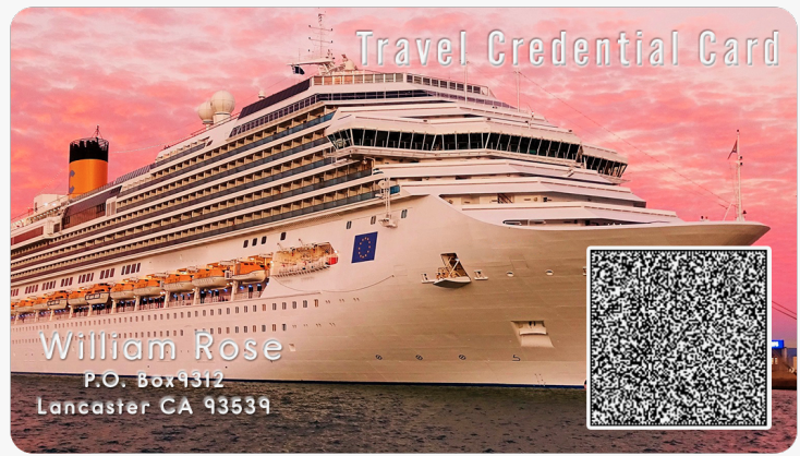
Fraud Proof Card