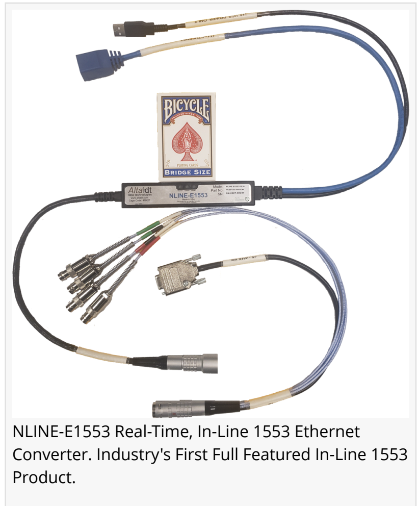
NLINE-E1553 Real-Time, In-Line 1553 Ethernet Converter. Industry's First Full Featured In-Line 1553 Product.

This press release can be viewed online at: https://www.einpresswire.com/article/550001974