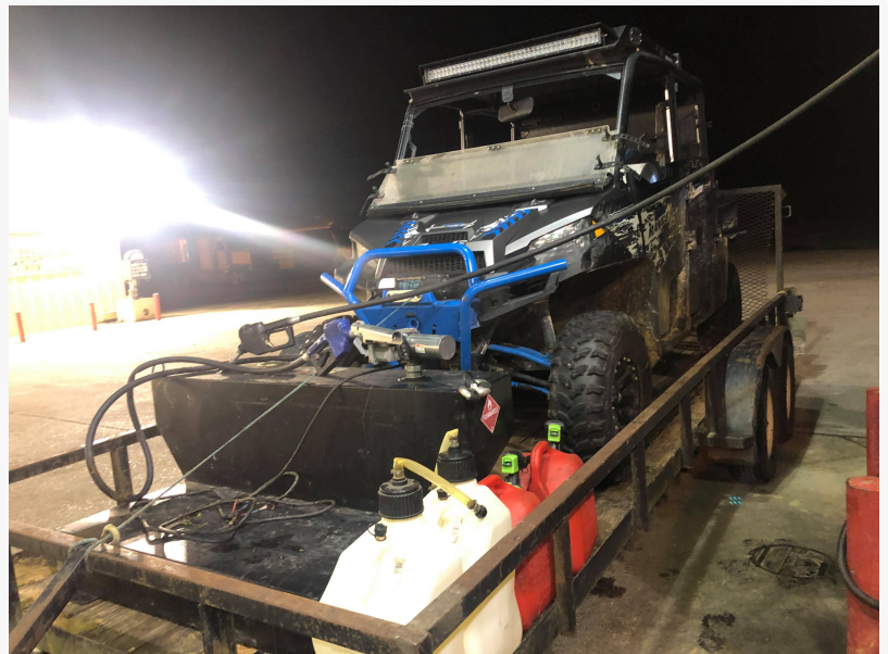
Pinnacle Search and Rescue (Cajun Navy 2016) UTV Staged in Preparation for Hurricane IDA's Landfall