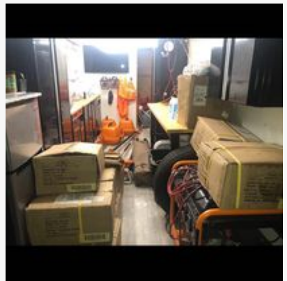
Pinnacle Search and Rescue (Cajun Navy 2016) Hurricane Ida Supplies.jpeg

This press release can be viewed online at: https://www.einpresswire.com/article/550009788