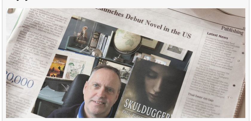
The novel has already earned acclaim, with one reviewer describing it as "masterful and thoroughly enjoyable.

"...a period well versed and presented with accuracy and authentic telling...masterful & thoroughly enjoyable... 5 stars