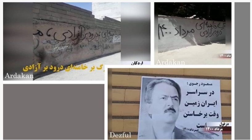
(NCRI) and (PMOI / MEK Iran): Ardakan and Dezful - Activities of the MEK Resistance Units – August 22, 2021.