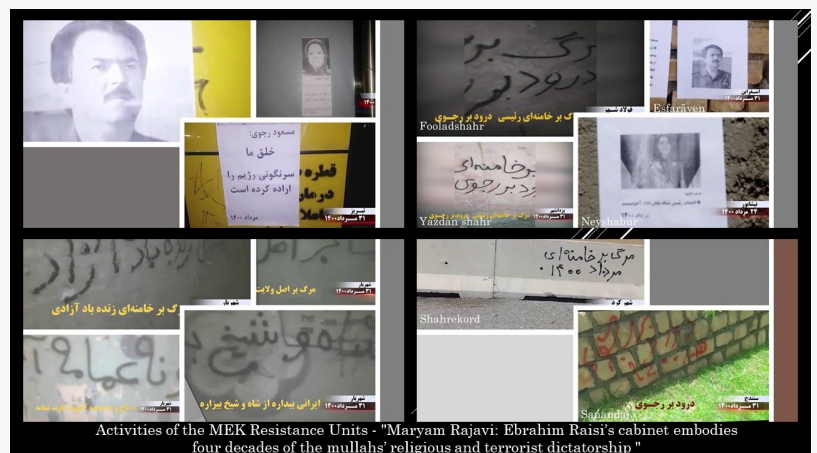
(NCRI) and (PMOI / MEK Iran): Activities of the MEK Resistance Units - "Maryam Rajavi Ebrahim Raisi's cabinet embodies four decades of the mullahs' religious and terrorist dictatorship"

This press release can be viewed online at: https://www.einpresswire.com/article/550051523