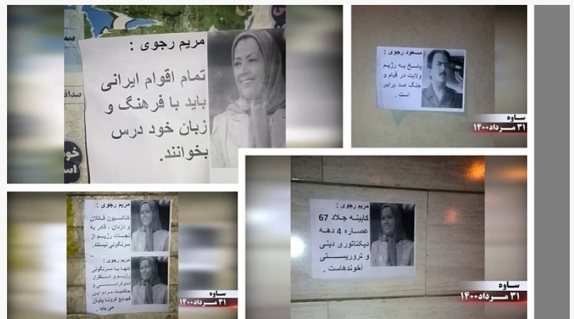
(NCRI) and (PMOI / MEK Iran): Saveh - Activities of the MEK Resistance Units - "Maryam Rajavi: Ebrahim Raisi's cabinet embodies four decades of the mullahs' religious and terrorist dictatorship " – August 22, 2021.