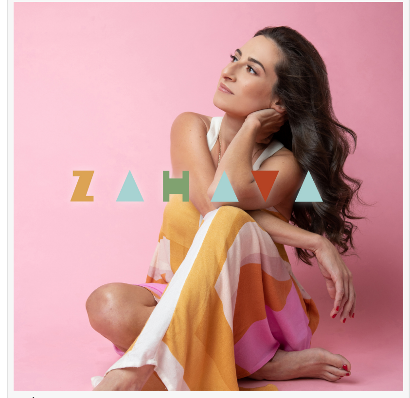
Zahava cover art