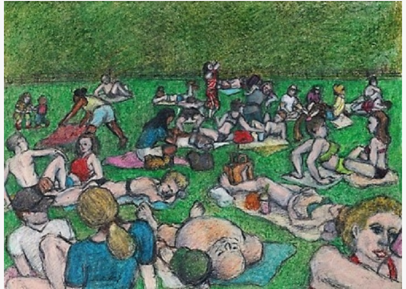
Stuytown Pleasures 2021

'Stuyvesant Town where I live has offered the grass oval for sun and relaxation. With Covid having access to do this is simply a miracle.'