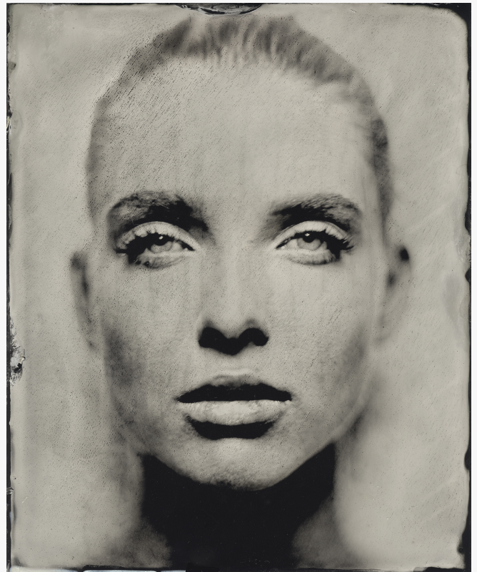
"Gazing Still" Collodion Wet Plate on metal by Igor Vasiliadis

Prints of this world-famous art bestseller are exhibited in hundreds of art galleries all around the world. This mystical, meditative artistic image showing gorgeous @stepankovskaya_sveta - Miss Russia and famous actress is made using 19th century authentic technology using 8x10 inches camera and optics proved by centuries. Pure sculptural beauty frozen with long exposure arise to antique esthetics.