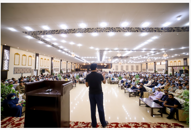
Extreme Commerce in Peshawar August 2021

Extreme Commerce has arranged meetups with its community of freelancers, entrepreneurs, programmers, e-merchants, and ecommerce players across Pakistan. Earlier similar events have been hosted with the community members in Sialkot, Faisalabad, and Gujranwala. Seminars are also planned for Islamabad, Rawalpindi, Lahore, and Karachi as well.