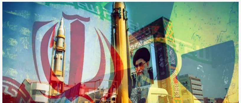
(PMOI / MEK Iran) and (NCRI): Iran said it would stop abiding by several nuclear commitments, including the number of centrifuges, the percent and level of enriched uranium, and certain restrictions regarding research.