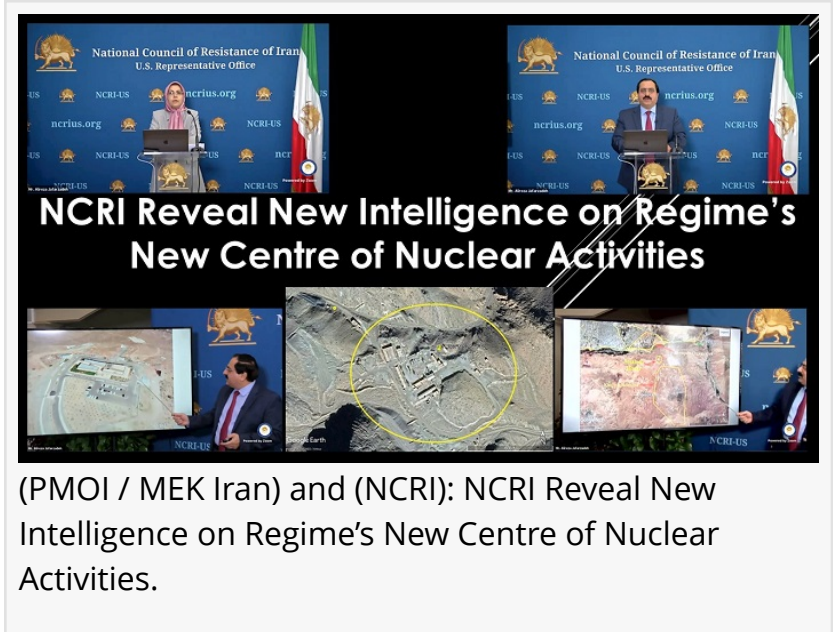
(PMOI / MEK Iran) and (NCRI): NCRI Reveal New Intelligence on Regime's New Centre of Nuclear Activities.

Eslami replaced Ali Akbar Salehi, who served the post since August 2013 and played a crucial role in the nuclear talks that led to the signing of the Joint Comprehensive Plan of Action (JCPOA).