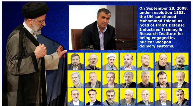
On September 28, 2008, under resolution 1803, the UN-sanctioned Mohammad Eslami as head of Iran's Defense Industries Training & Research Institute for being engaged in, nuclear weapon delivery systems.