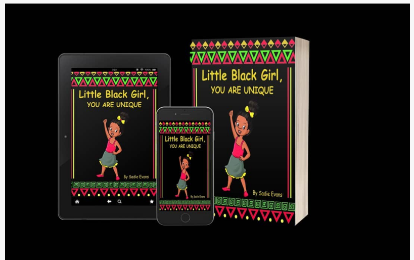
The George Floyd situation inspired cover and book