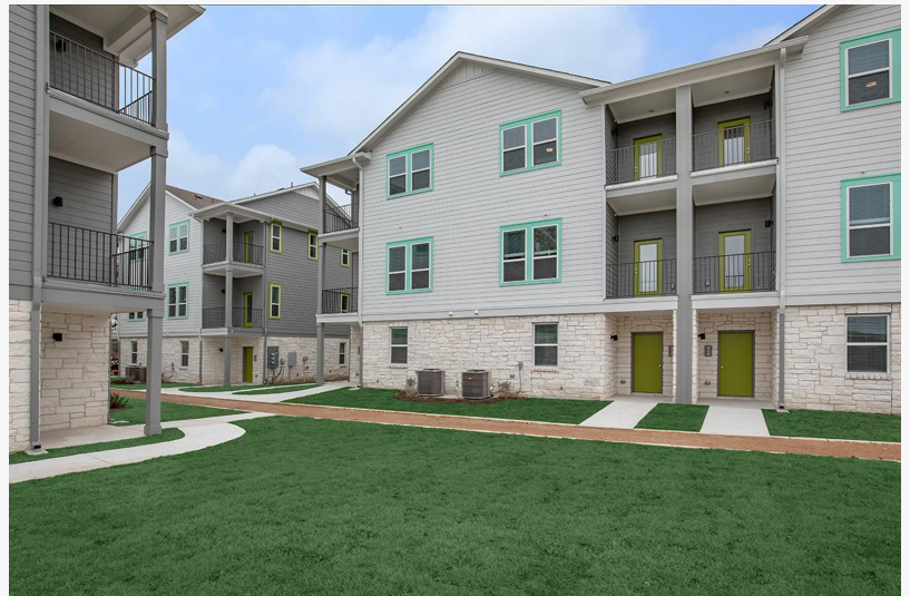
Trailside Oaks Exterior