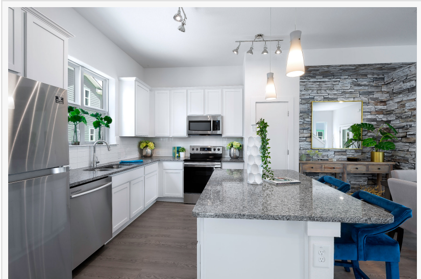
Kitchen at Trailside Oaks

Sairam Kota, Principal for Kota Investments states, "I am excited to be expanding our portfolio into Central Texas with the acquisition of Trailside Oaks. The combination of the unique floor plans and the amazing location was something we couldn't pass up. The team at ResProp has been great to work with and this is the second of many properties we will work together on in the future."