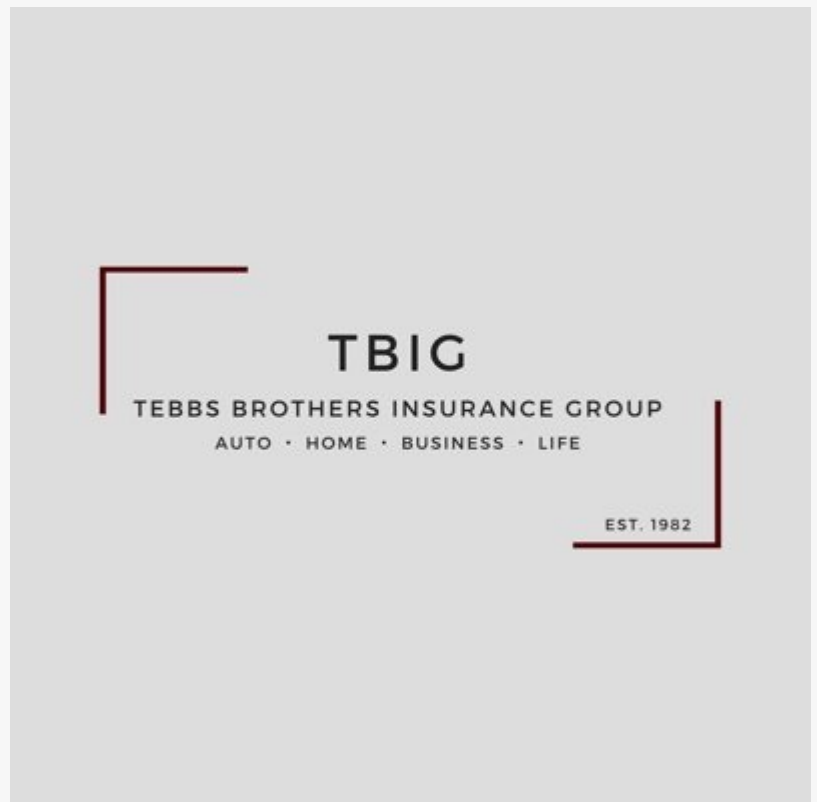
'Best of State' Insurance Murray UTAH: Top AUTO Life