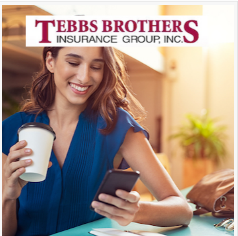
TEBBS Bros: UTAH's #1 BUSINESS Home Life Auto INS

Why Auto Insurance? Keeping your vehicle insured is simply the responsible thing to do, and it's an essential financial decision that you cannot drive without. AUTO Insurance helps to reduce or cover property damage costs, replacement parts for your car as the result of an accident,