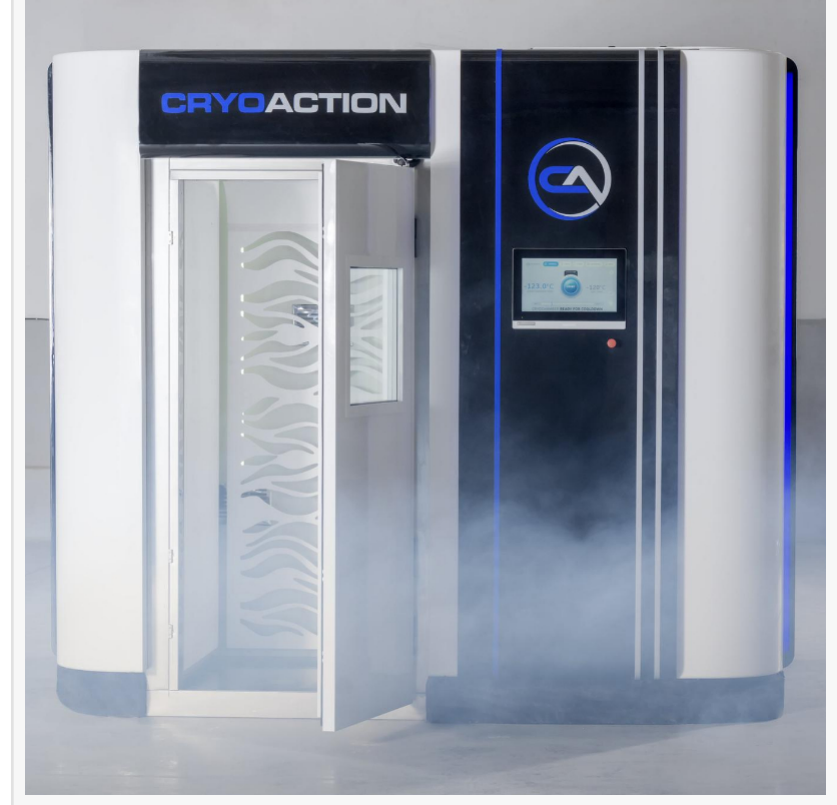
CryoAction CryoSolo Whole Body Cryotherapy Chamber

preferences. We're delighted to be the first leading whole body cryotherapy provider offering a choice of cryochambers in a comprehensive range of sizes and formats.'