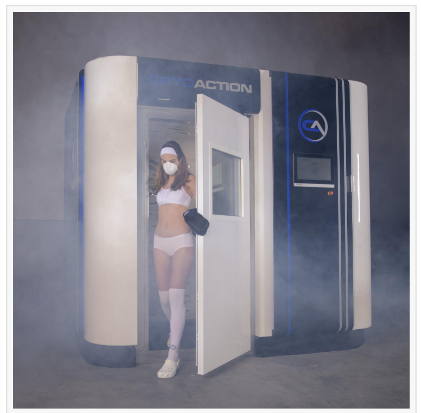
CryoAction whole body cryotherapy chamber is now available in electric and nitrogen

The technological breakthrough enabling CryoAction to offer the electric cryochamber comes after many months of research and innovation by their team of expert