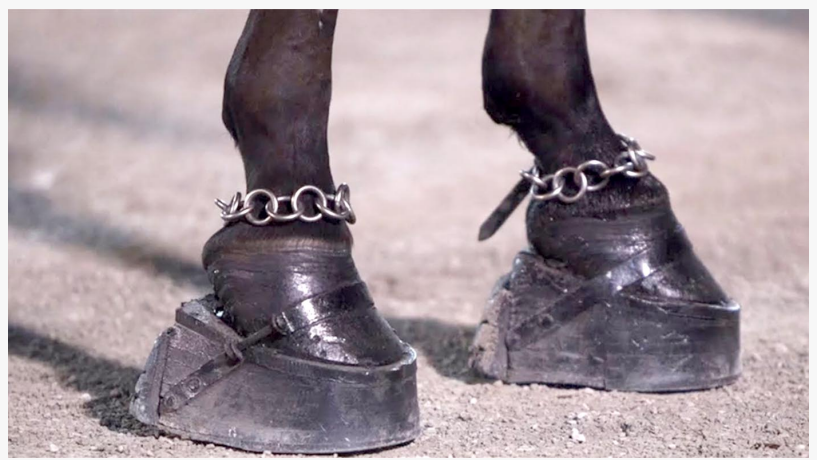
"Big Lick" Stacked Shoes and Ankle Chains Utilized on Tennessee Walking Horses

The PAST Act only achieved passage of the measure through the House in 2019 as result of changing the bill's name to the U.S. Senator Joseph D. Tydings Memorial PAST Act to honor the late Joe Tydings, a Democrat for Maryland, who authored the HPA in 1970 and passed away in 2018. The measure cleared the U.S. House by a vote of 333 to 96, but with opposition from Senators who hailed from Tennessee and Kentucky and 93 House Republicans opposing the measure, the bill was dead on arrival in the Upper Chamber. In light of that circumstance AWA pulled together representatives still involved in the breed to form revisions to the PAST Act that would help get the measure through the Senate.