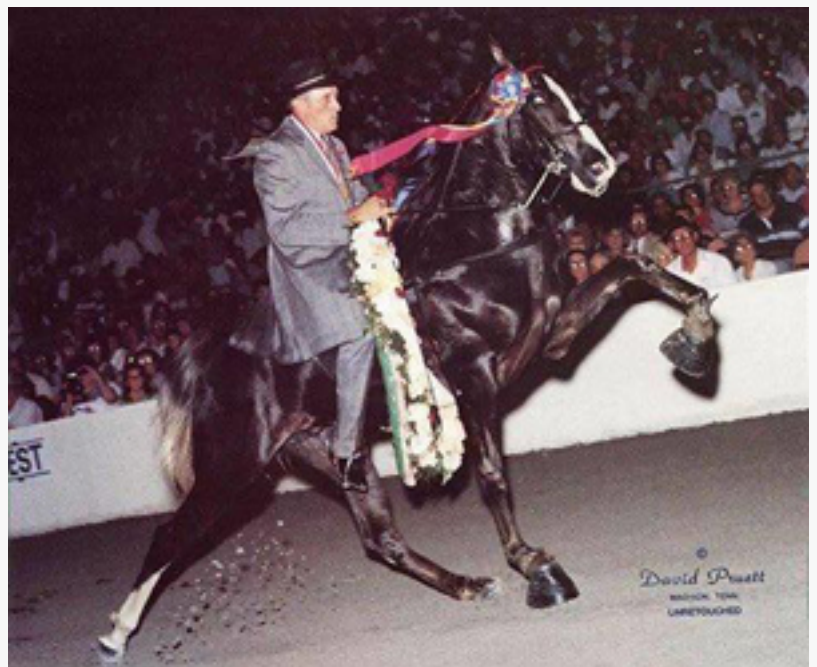
1992 Tennessee Walking Horse 2-Year-Old World Grand Champion JFK