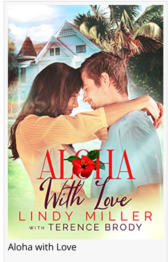
Aloha with Love

Her highly anticipated upcoming release, Sleigh Bells on Bread Loaf Mountain , will be just in time for Christmas. Fashion editor Roxanne Hudson decides to head up to her family's Vermont cabin