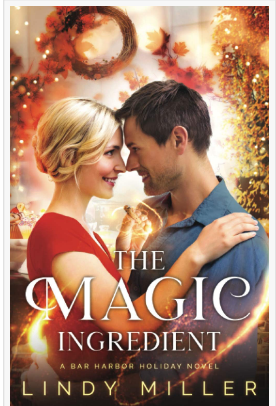
The Magic Ingredient