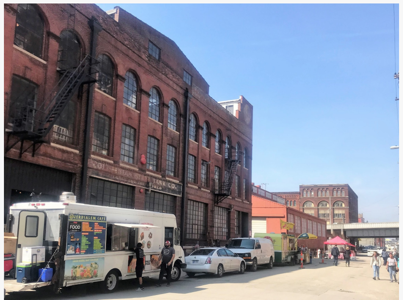
Kansas City's historic West Bottoms District