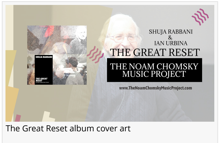
The Great Reset album cover art

This press release can be viewed online at: https://www.einpresswire.com/article/550340533