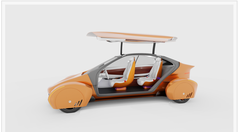
2 Seater eCryptoCar

Each Soventem vehicle has been carefully designed to stand out amongst the crowd, and the forward-thinking brand is striving to ensure every aspect of the manufacturing process is environmentally friendly. The completely carbon-neutral build utilises the greenest materials