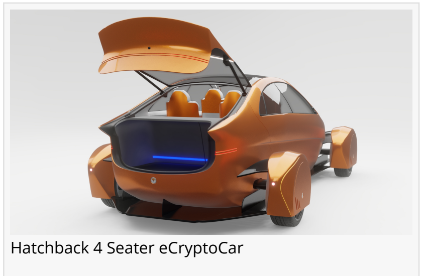
Hatchback 4 Seater eCryptoCar

require mains charging or a visit to the nearest hydrogen filling station, this game changing technology will raise an eyebrow with automotive manufacturers!