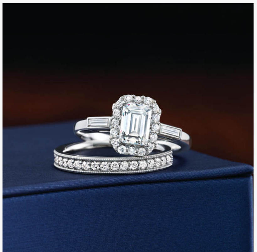
top Georgetown Texas Jewelry store

The ability to expand a business's reach to the online market post-covid-19 pandemic is critical to growth and scaling and will continue to be more important to a jewelry store's survival plan going forward. Summit Jewelers has led the charge in utilizing jewelry store Digital Marketing Strategies to literally put them on the map in the Greater Austin Texas Area. Summit Jewelers provides customers with Custom CAD drawings that are emailed to the clients within 48 hours of the meeting. All custom jewelry can be modified to meet your specifications, engraving available,