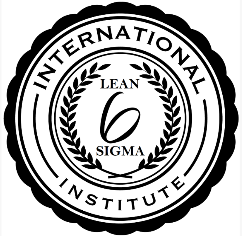
International Lean Six Sigma Institute

This press release can be viewed online at: https://www.einpresswire.com/article/550666533