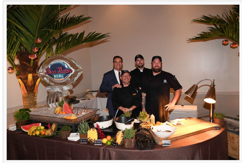
The Boca Raton Resort Team displaying their showcase

South Florida residents and businesses will once again gather at this popular networking and community fundraising event, as one of the official lead-in events to countdown to the Roofclaim.com Boca Raton Bowl (Saturday, December 18 at FAU Stadium). For this high-spirited and pride-rallying evening, guests are encouraged to come out wearing their alma mater or favorite college team's