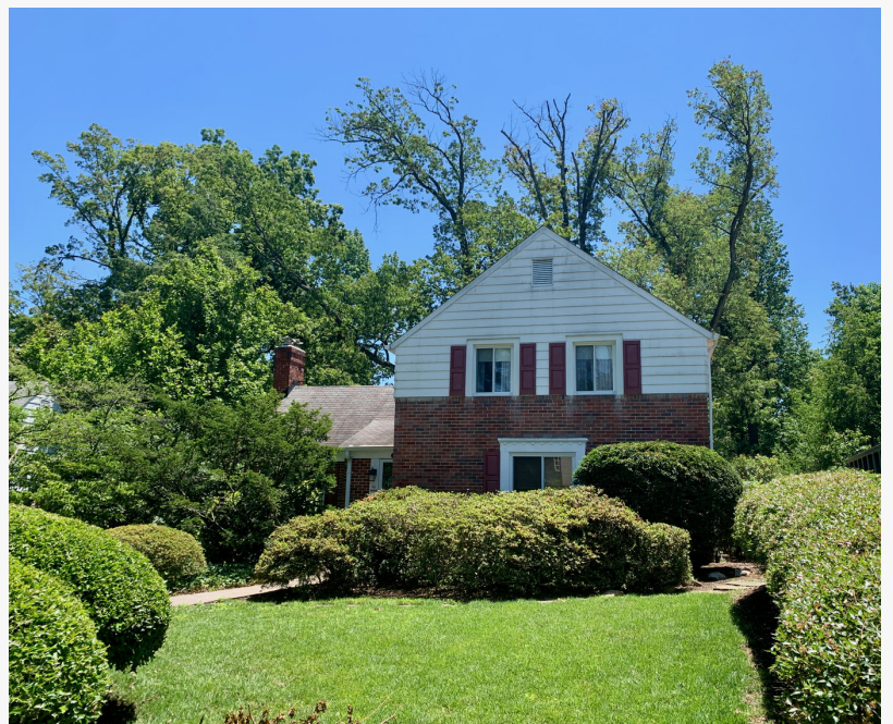
3111 Circle Hill Rd., Alexandria, VA 22305