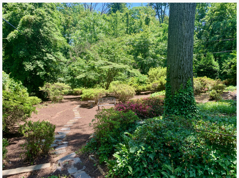
3111 Circle Hill Rd., Alexandria, VA 22305