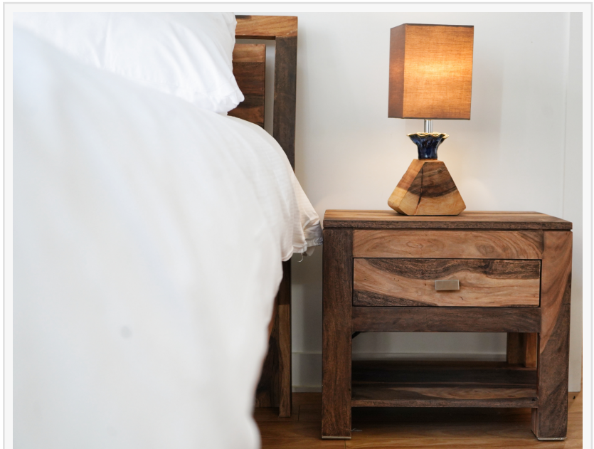
Zen Collection By Casa Suarez Canada