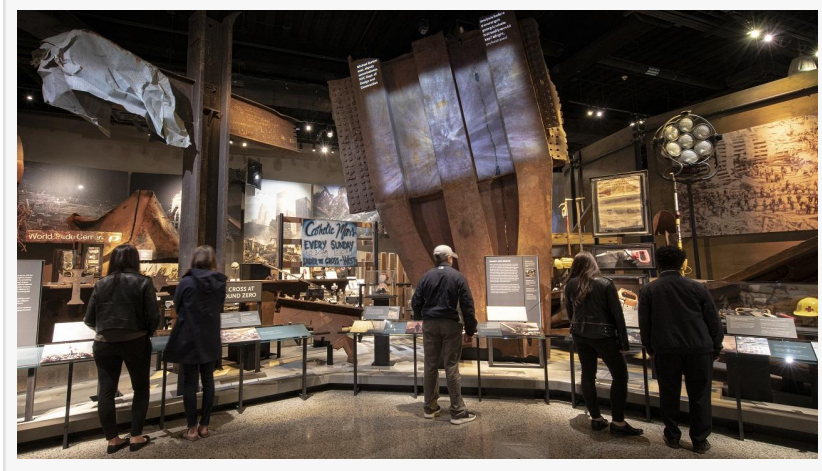
National September 11 Memorial & Museum

For more, visit www.hr1242resilience.com.