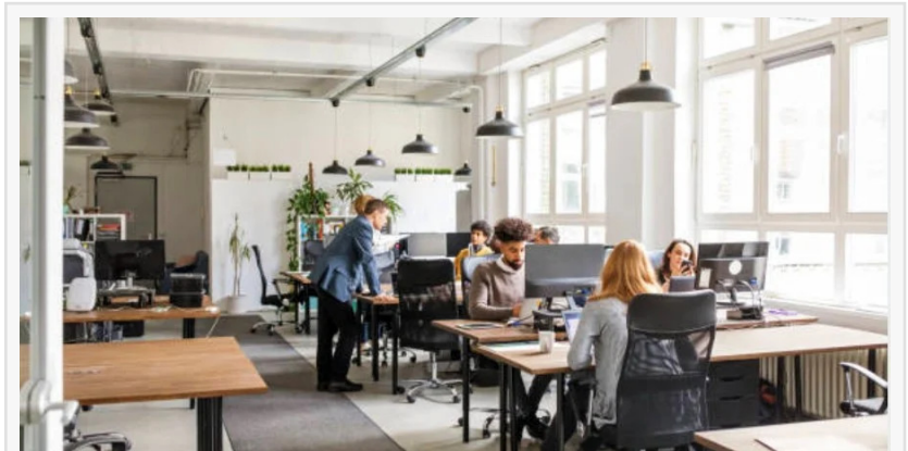
Design the workspace of the future with desk occupancy data

when it comes to how they use technology in their daily operations. DT and certified partner Noova teamed up to deploy the sensors all through the company's offices as part of the company's mission to create the 'workspace of the future' for its employees.