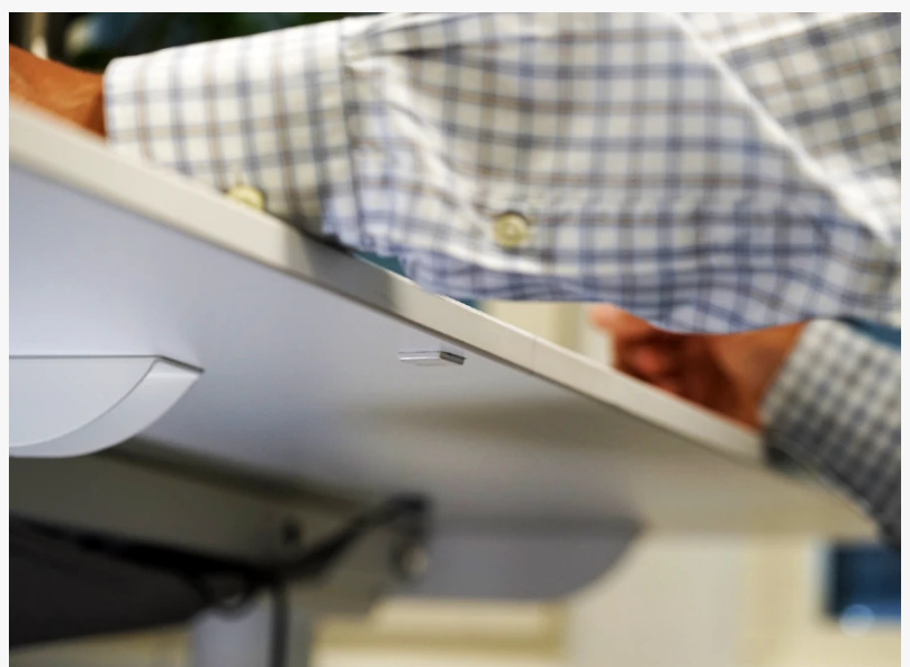
Desk occupancy sensors that are easy to install and not visible to the users

"The partnership with DT has opened business opportunities that give great value to our customers in the form of insights that are enabling them to take actions and decisions based on facts, not their gut feeling. By integrating data from the DT sensors into our applications we can combine various data and do unique analyses and presentations. Thanks to 'zero' installation time and no maintenance, the implementation of the sensors is painless." Eyvind Kjensli - Sales Director, Noova