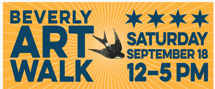
2021 Beverly Art Walk - September 18, 2021 | BeverlyArts.org