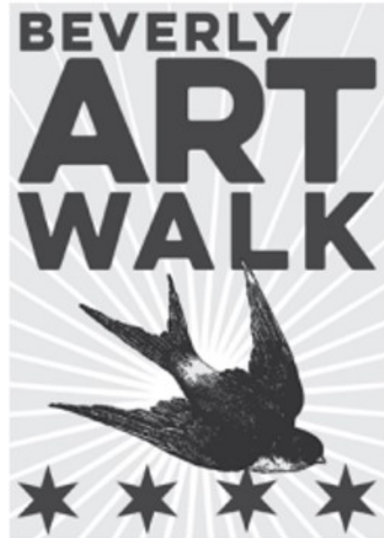
2021 Beverly Art Walk - September 18, 2021 | BeverlyArts.org

The Beverly Area Arts Alliance (The Alliance) cultivates collaboration between artists and community members to foster Beverly as a hub of culture and creativity on Chicago's far