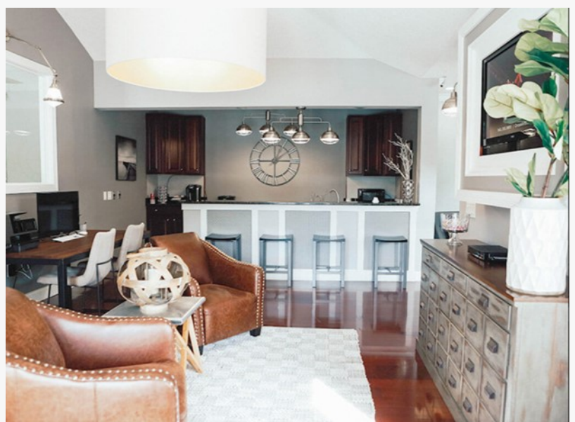
Bradenton Reserve Kitchen