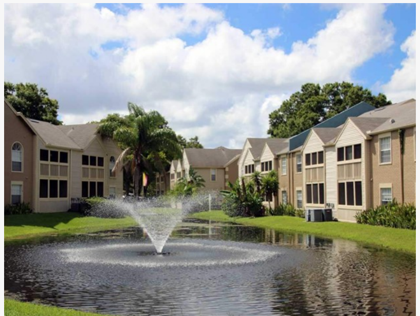
Brandenton Reserve Apartments