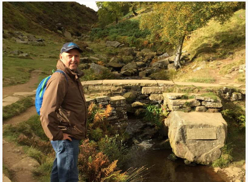
Doing Research for Skulduggery-Haworth, Yorkshire

The hype around this book has been unquestionable