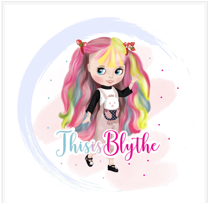
This Is Blythe Reviews Logo

with clothes and/or accessories reasonably. Blythe fans are assured of receiving high-quality