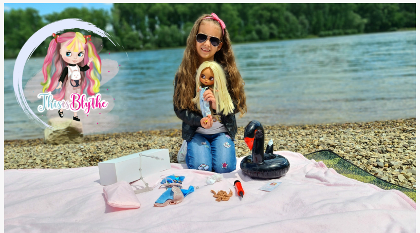
This Is Blythe Reviews Holding Custom Blythe Doll