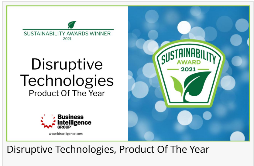
Disruptive Technologies, Product Of The Year

*Disruptive Technologies were also finalists for the Sustainability Product of the Year Award in the Technology & Telecommunications category