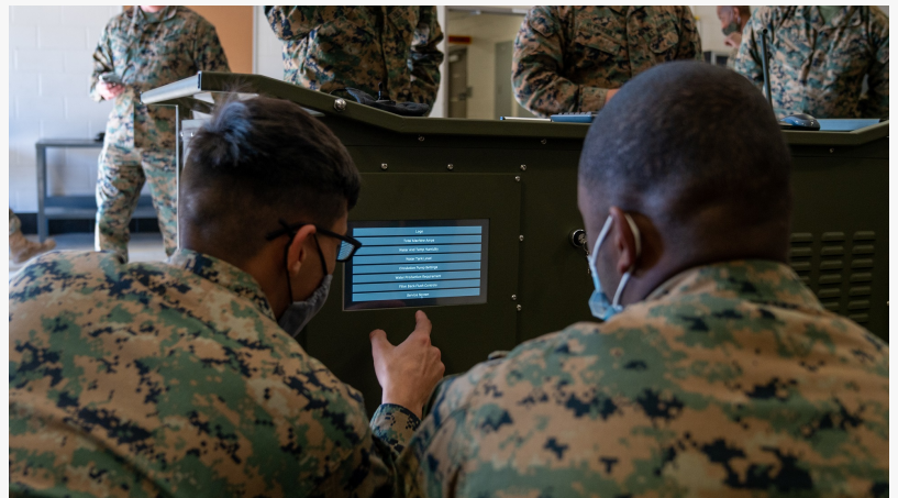
U.S. Marines operating the maxim unit.