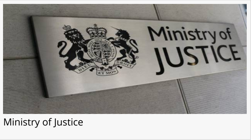
Ministry of Justice