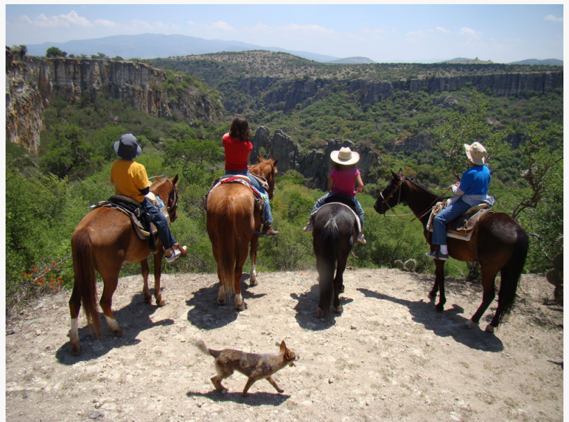
Ride through spectacular countryside with breathtaking views and stunning landscapes in San Miguel de Allende, Guanajuato