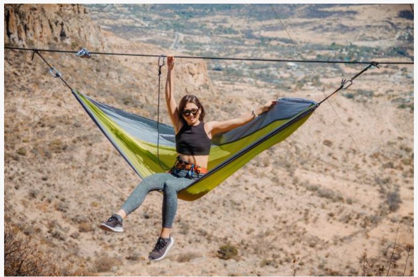
Contemplate a sunrise or sunset from the tranquility of a hammock while suspended on a cliff in Tierra Blanca, State of Guanajuato

And the state of Guanajuato also makes it easy for visitors, with air and land connectivity that facilitates access from anywhere in the United States and Canada. In addition, Guanajuato has a long tradition of hospitality that is expressed in its accommodation options.