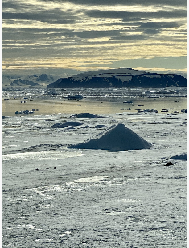
The desolation of a collapsing world

Eye-V Gallery was created in 2021 focused on neo-naturalist photography, hosting an international community of photographers, and based in Uruguay, Milan, and New York. Eye-V is