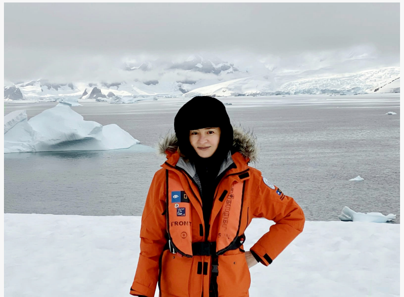
Photographer on location