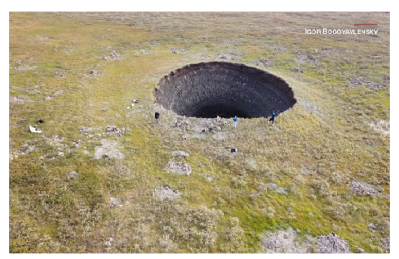
7,000 exploding methane holes in Siberia linked to climate change