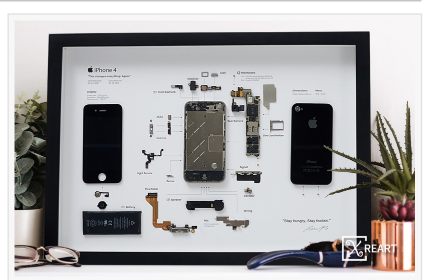
Xreart iPhone 4 Teardown Frame

Xreart takes tech gurus on a tour of the most classic and revolutionary tech products by deconstruction art, exuding the nostalgia of that era. The artwork is created using discarded phones from authorized phone suppliers, redesigning them through a meticulous process of disassembling, cleaning, sterilizing, and framing.