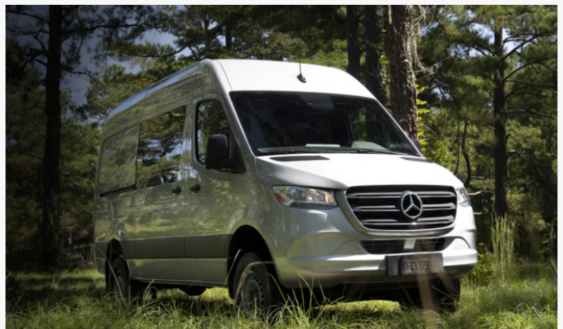
Mercedes Benz Sprinter Van