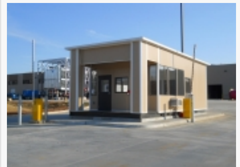
Ballistic Rated Booth