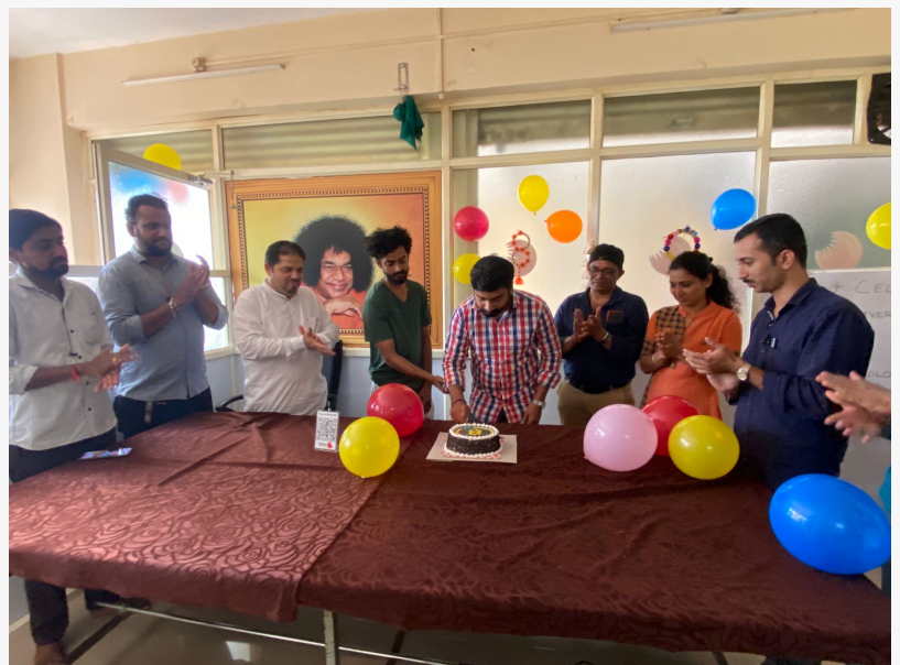
India Developers Celebrate BitcoinZ 4 Year Birthday with a BitcoinZ Birthday Cake