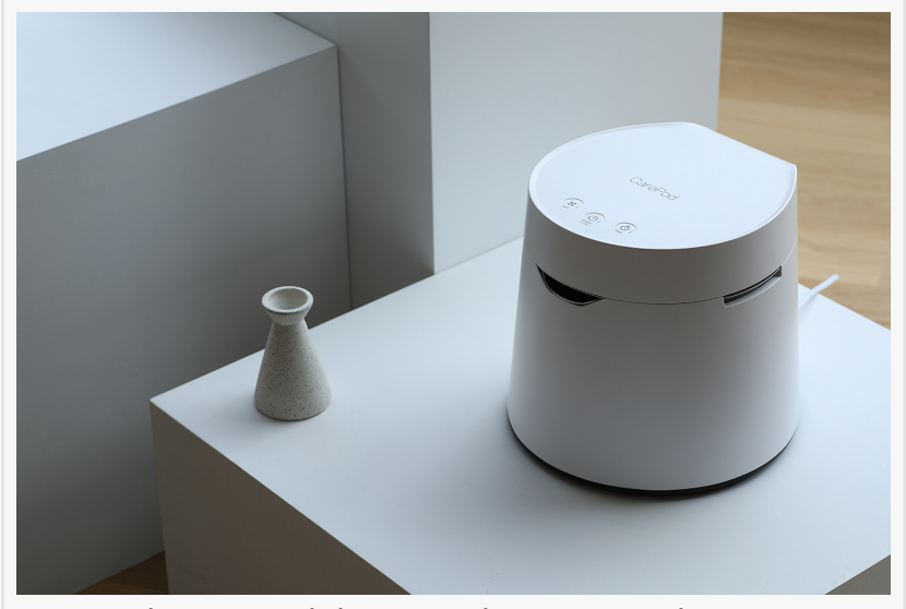
Carepod One model won iF design award