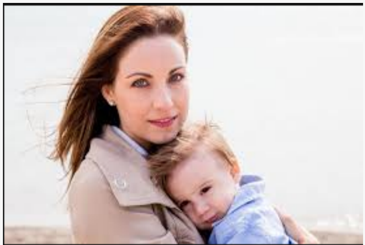
Group Health Insurance Arlington