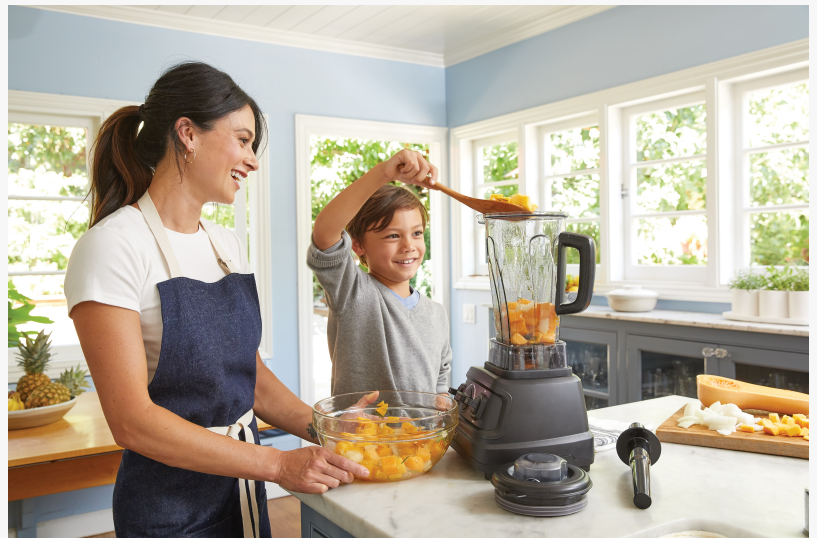
Arlington Health Insurance Agent