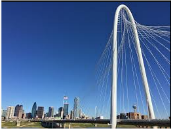
Health Insurance Arlington

Insurance4Dallas 2131 North Collins, Suite 433-517 Arlington, TX 76011